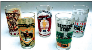
Kentucky Derby Glasses