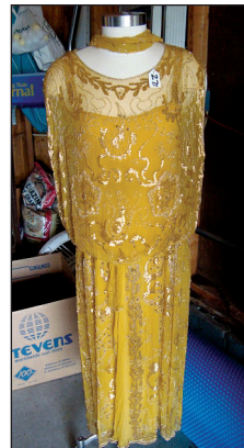
Heavily Beaded Silk Flapper Dress/Scarf