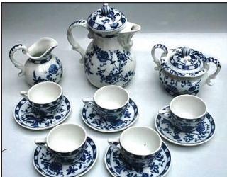
Child's Tea Set