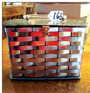
Great Woven Purse (Rare)!

BUSINESS (517) 339-0200 CELL (517) 819-0071 www.DennisBealsAuction.com E-Mail - dbeals2974@yahoo.com