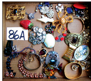
1 of 87 Vintage Jewelry Collector Box Lots!