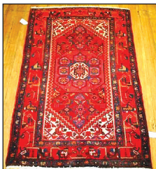
Several Sizes of Persian Rugs