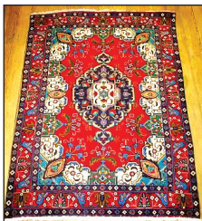
1 of 17 Persian Rugs