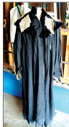
Black Coat C. 1890