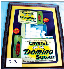
Another Example of Quality Advertising Items!