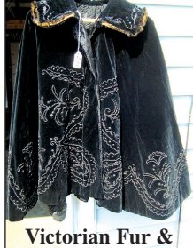
Victorian Fur & Bead Trimmed Velvet Cape