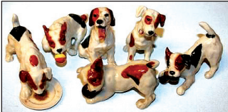
Small Coll. of Royal Doulton & Beswick Dogs