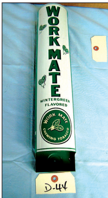
Store Dispenser in Like New Condition!