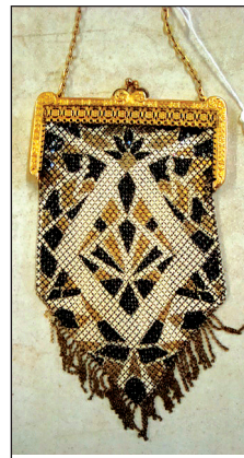
Mandalian Mesh Bag