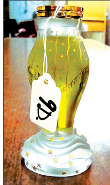
Schiaparelli "Zut" Bottle C. 1949