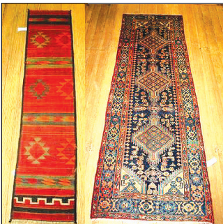
Pair of Persian Runners