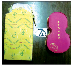
"Zigane" by Cord