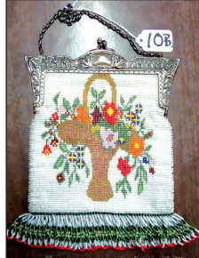
Vintage Beaded Bag