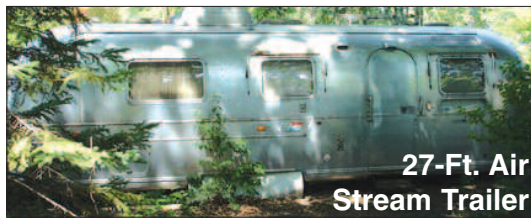
27-Ft. Air Stream Trailer

Ring One: Tools and Related • Ring Two: Antiques Furniture and Related