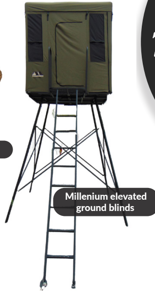
Millennium elevated ground blinds