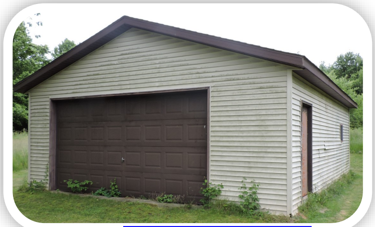
24' X 30' Pole Barn