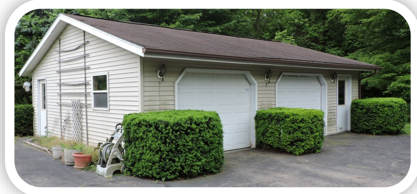
24' X 34' Garage/Shop