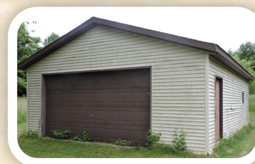
24' X 34' Garage/Shop