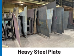
Heavy Steel Plate