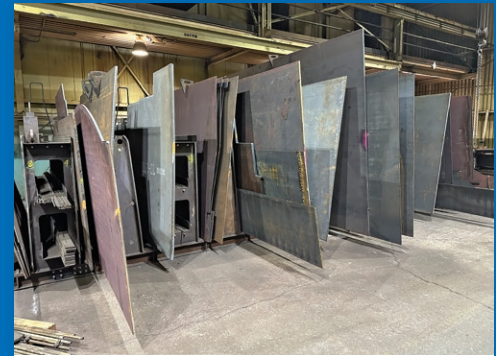
Large Heavy Plate and Storage Rack