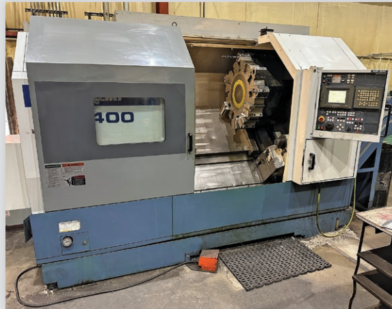
Mori Seiki SL-400B/800 CNC Turning Center