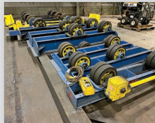
Webb Turning Rolls