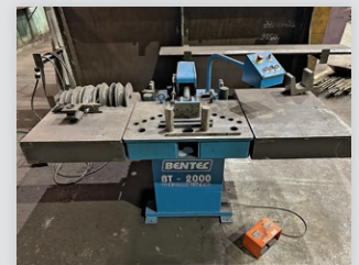
Bentec BT-2000 Ram Bender