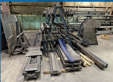
Heavy Press Brake Dies