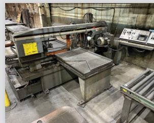
HEM Auto Band Saw