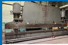
24' Press Brake

CIA-INDUSTRIAL.COM 2020 DUNLAP ST. CINCINNATI, OH 45214 513.241.9701