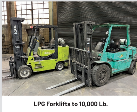
LPG Forklifts to 10,000 Lb.