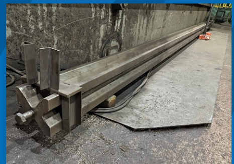
24' x 6.5" x 6.5" Four-Way Die