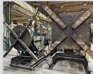
Positioners to 15,000 Lb.