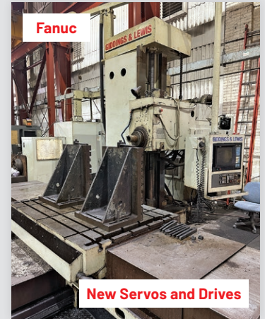
4" G&L CNC Boring Mill