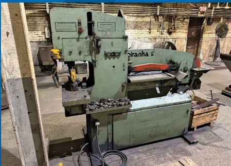
88 Ton Piranha PII-88 Hydraulic Ironworker