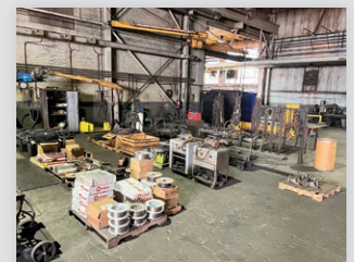
Support Equipment for Heavy Fabricating and Machining Plant