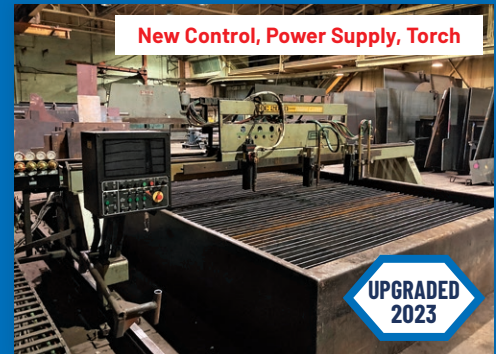
New Control, Power Supply, Torch