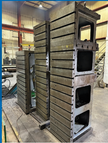
Angle Plates to 2' x 8'