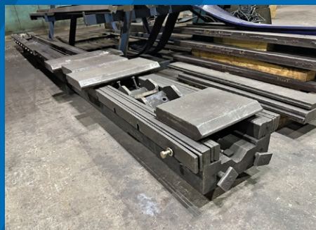
239" Adjustable Channel Die