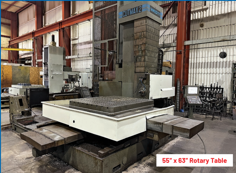
55" x 63" Rotary Table

INSPECTION: Day prior to Auction Date or by appointment with jeffjr@cia-industrial.com