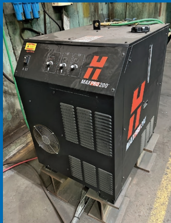
CSI 10' x 25' CNC Plasma Table, Upgraded 2023 at Cost of $150K