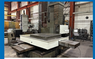
CNC Boring Mills