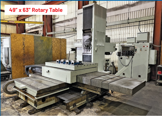
49" x 63" Rotary Table