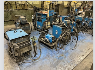
Miller Welding Power Supplies