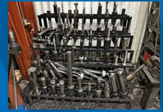
Toolholders Including Gerardi Right Angle Head