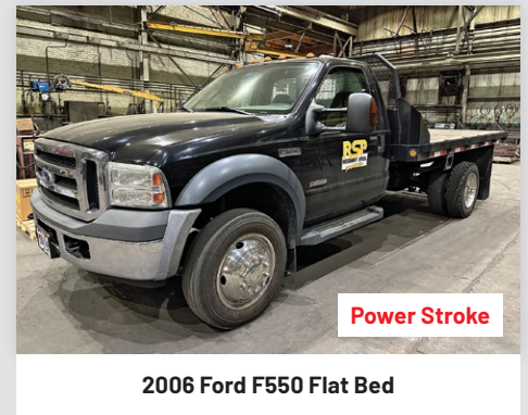
2006 Ford F550 Flat Bed