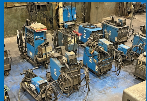
(15) Miller Welders to 650-Amp