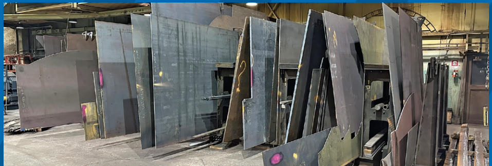
Large Heavy Plate and Storage Rack