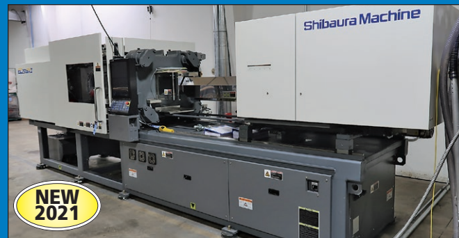
250 Ton Shibura EC250SXIII-V70-8 Electric Molding Machine (2021)