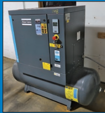
Atlas G7P Compressor