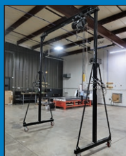
Ultra Clean Shop Equipment