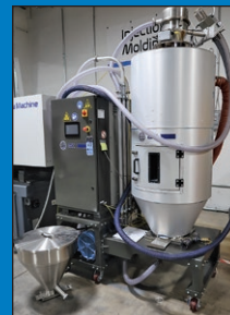
AEC NGX100 Dryer