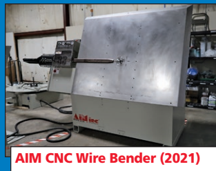
AIM CNC Wire Bender (2021)