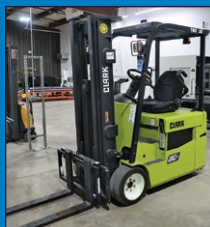
Clark TM20 Forklift