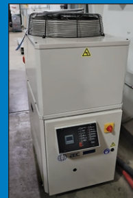
AEC PSA2 Chiller