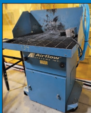
Airflow Downdraft Table