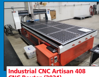
Industrial CNC Artisan 408 CNC Router (2021)