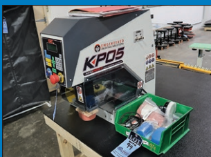
EPS KP05 Pad Printer