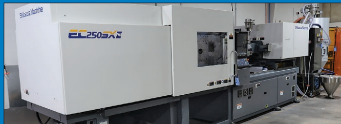
250 Ton Shibura EC250SXIII-V70-8 Electric Molding Machine (2021)

For Detailed Specifications, Photos, Link To Online Bidding And Terms Of Sale.