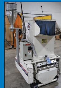
15 HP MPG Granulator