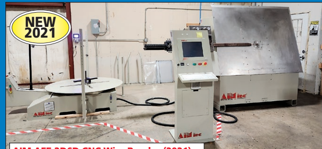
AIM AFE-2D6D CNC Wire Bender (2021)