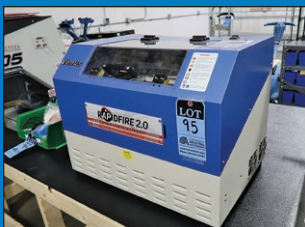
VenusLaser Plate Maker