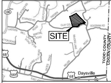
VICINITY MAP (TODD COUNTY, KENTUCKY)