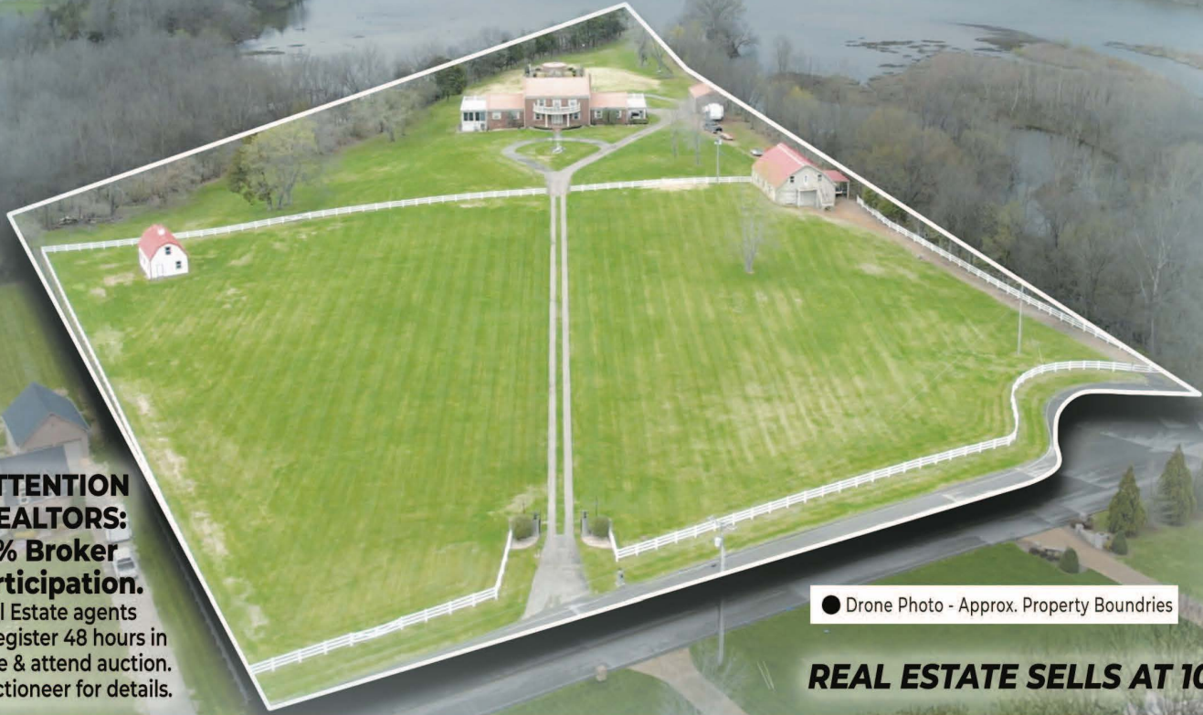
● Drone Photo - Approx. Property Boundaries

ATTENTION REALTORS: 1% Broker Participation. Real Estate agents must register 48 hours in advance & attend auction. Call Auctioneer for details.