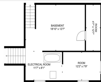
TOTAL: 1381 sq. ft. Main: 1304 sq. ft., 1st Floor: 2, 1333 sq. ft., Basement: 238 sq. ft. EXCLUDED AREAS: HALL, 182 sq. ft., ELECTRICAL ROOM, 128 sq. ft., BASEMENT: 238 sq. ft. FLOOR PLAN CREATED BY CIRCLE K AND MEASUREMENTS OBTAINED VISUALLY BUT NOT GUARANTEED.