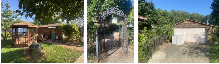
NICE 3 BED, 1.5 BATH BRICK & VINYL RANCH HOME with DETACHED GARAGE, DECK, SUN ROOM & GAZEBO!

Plus: FURNISHINGS, ANTIQUES, COLLECTIBLES, TOOLS, KILN, BICYCLES, HOUSEHOLD & MORE!