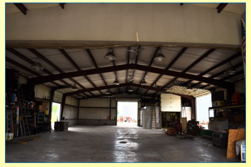
Real Estate offered 1st @ 10am

Real Estate Inspection: Thursday August 1 from 11-1pm.