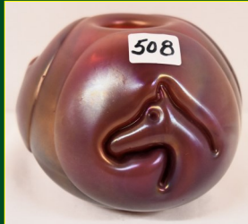
508. 3 1/2" Baker, Labino Studio schmeltz vase w/ horses