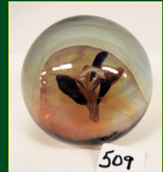
509. 1966 Labino paperweight.

Held at Whalen Auction Bldg., 8020 Manore Rd., Neapolis, OH (gps Grand Rapids 43522)