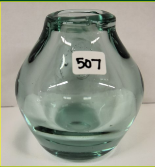
507. 4 1/2" Labino 1968 light green vase

Held at Whalen Auction Bldg., 8020 Manore Rd., Neapolis, OH (gps Grand Rapids 43522)