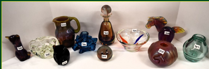
503. 6" Baker 2006 Yellow & red sculpture horse