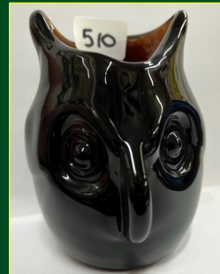
510. 3 1/2" Labino 3-1976 dark red & brown owl