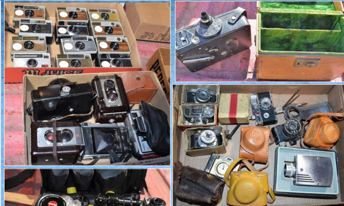
Camera collection from The Late Milton A. Campbell Trust