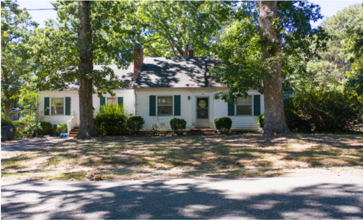
12 Mansion Dr. Clarksville, VA. Home currently rented.