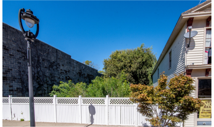
Vacant lot joins 328 Virginia Ave. COMMERCIAL