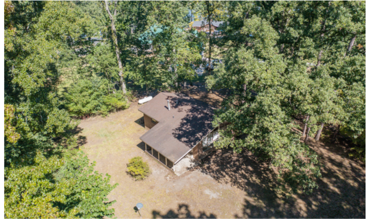
181 Oakwood Dr. Clarksville, VA. Vacant home formally rented. Close to the lake.

Directions: From Clarksville Rt. 15 North 2 1/2 miles to Prestwoud Drive (St. Rt. 1601), turn left. Continue on Prestwoud Drive for 1 mile to Rock Hill Road (St. Rt. 1602), turn right, and continue on to Oakwood Drive (St. Rt. 1603), turn right, and go 1/10th mile to property on left.