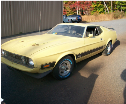
1973 Mustang Mach I