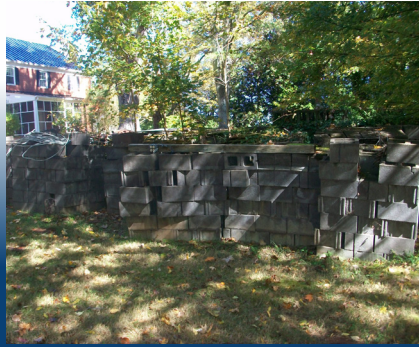
Cinderblocks Qty 1,100