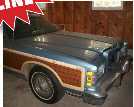
1975 Ford Country Squire