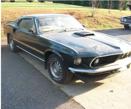
1969 Ford Mustang Cobra Jet