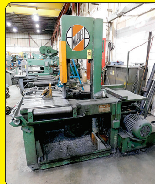
Marvel Model 81A7/M5 Auto. Tilt Frame Vertical Band Saw