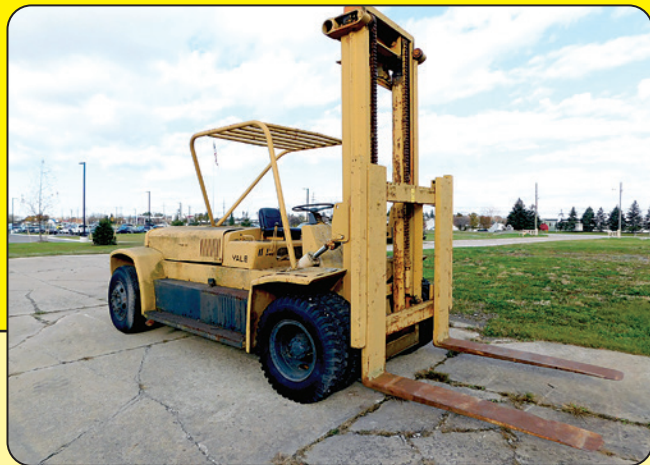
Yale Model G3V-200-FAS-G Yard Forklift