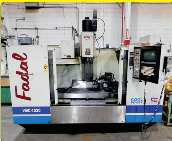
Fadal 6-Axis CNC Vertical Machining Center