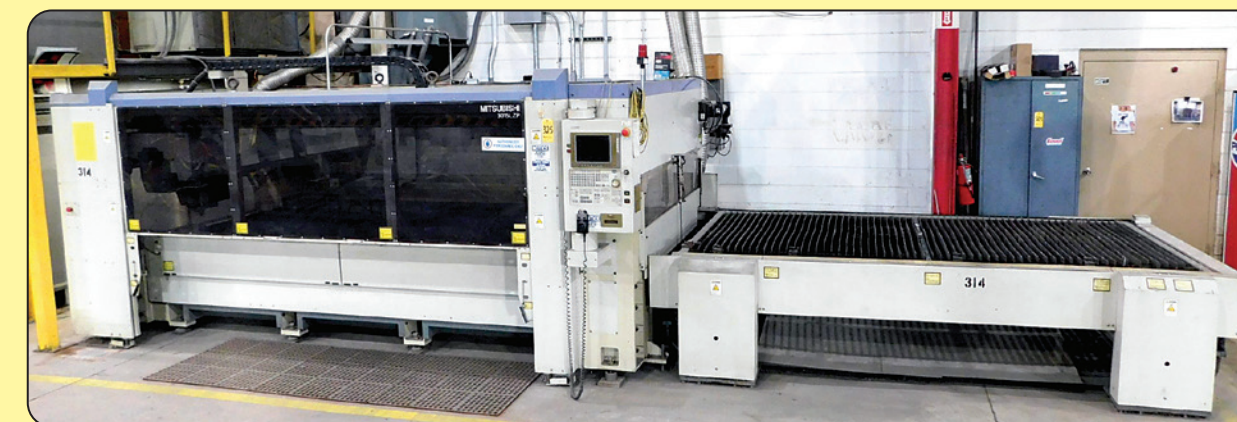
Mitsubishi 3015 LZP CNC Laser