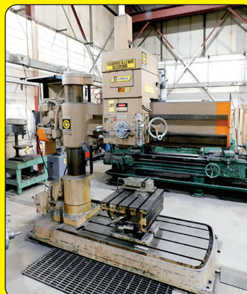
Giddings & Lewis Bickford Chip Master Radial Arm Drill