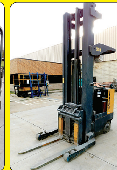
Raymond Model 040-R60TT Stand On Electric Forklift