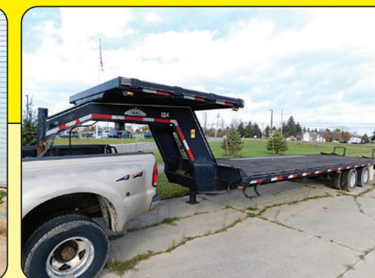
Moritz Tandem Axle, Dual Tire Gooseneck Trailer