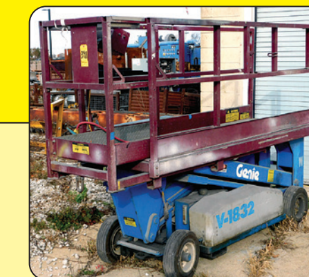
Genie Model V-1832 Electric Scissor Lift