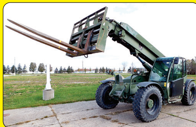
Sky Trak Model MMV Telehandler