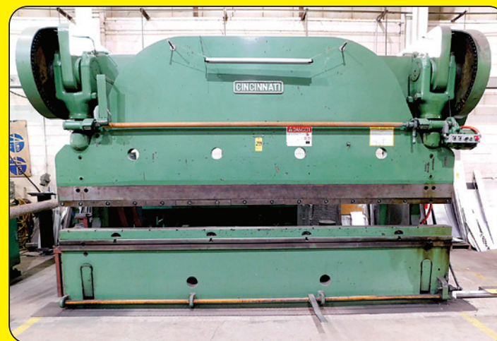
Cincinnati Model 130-12' Mechanical Press Brake