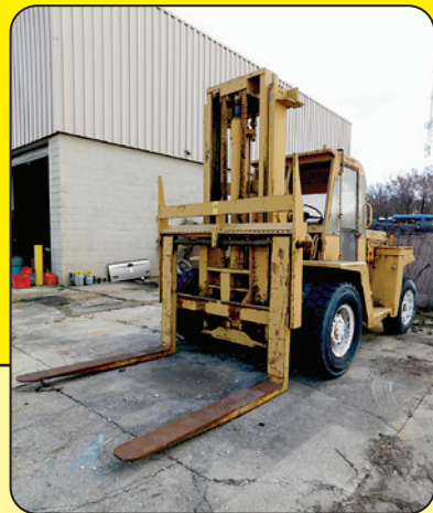
Clark 25,000 Lb. Fork Lift