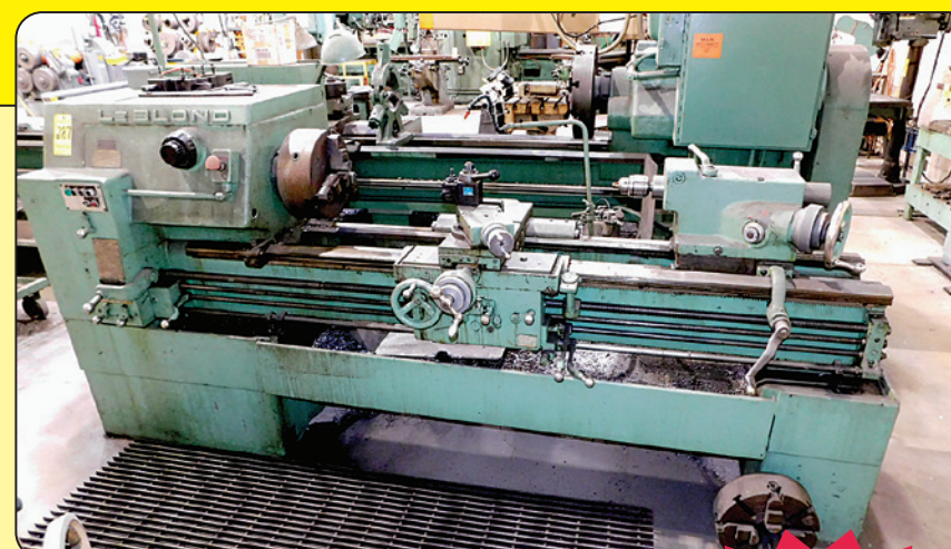
Leblond 18" X 60" Toolroom Lathe