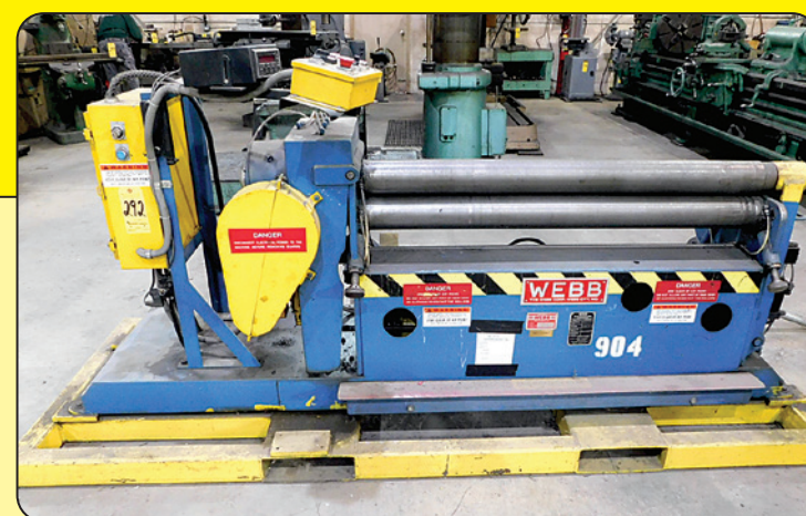
Webb Power Initial Pinch Roll, 4' X 12 Ga.