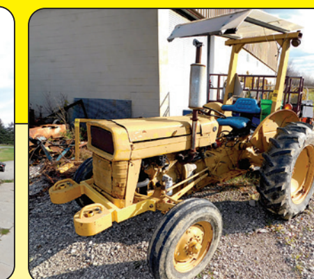
Ford Model 9A Tractor