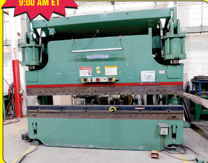
Cincinnati 230CB X 10 Hydraulic Press Brake

Auction Date: THURS., DEC. 7, 9:00 AM ET