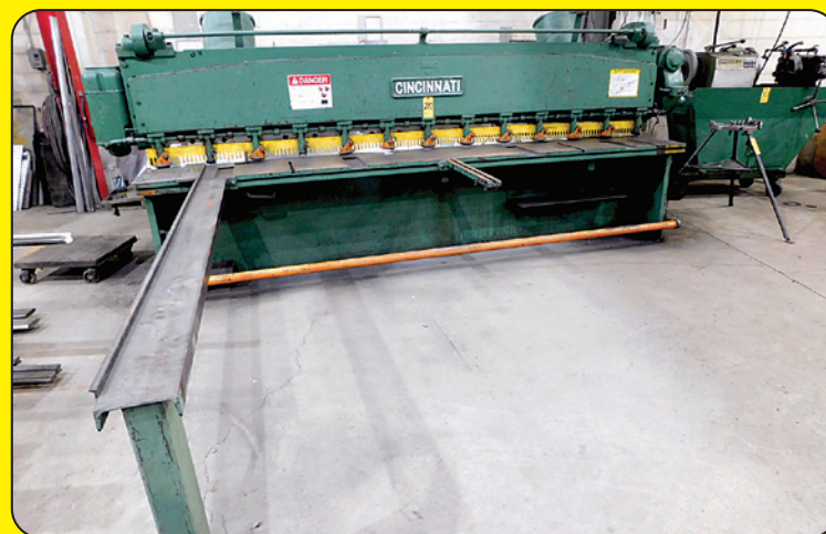
Cincinnati Model 1412 Power Squaring Shear