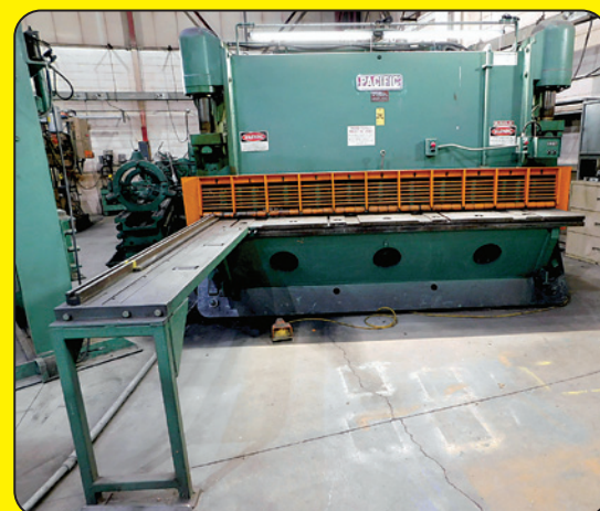
Pacific Model 500R-10 Hydraulic Plate Shear