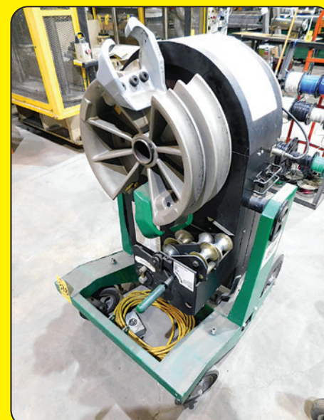
Greenlee Smart Quad Bender