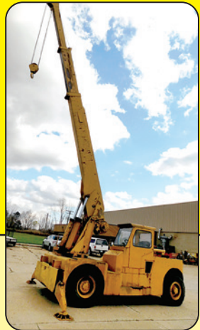
Grove 10 Ton Mobile Yard Crane