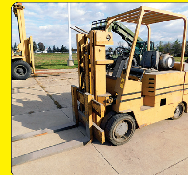
Allis Chalmers 10,000 Lb. Fork Lift