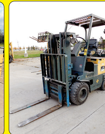
Hyster Model J40XL Electric Forklift