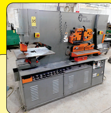
Spartan Model IW110DX/2 Hyd. Ironworker

Inspection: Wednesday, December 6, 9:00 AM - 4:00 PM