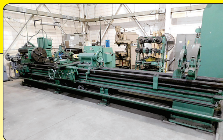
Lehmann 28" X 16' Engine Lathe