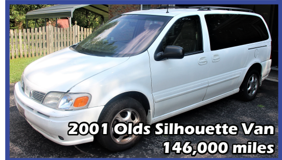
2001 Olds Silhouette Van 146,000 miles

TERMS on Real Estate: 15% down day of sale, balance with deed. Taxes of $1483 will be prorated. No Buyers Premium. Personal Property terms are cash or check day of sale. 4% charge for credit cards. Pictures and more information on the website at www.garyauction.com (615) 302-2680