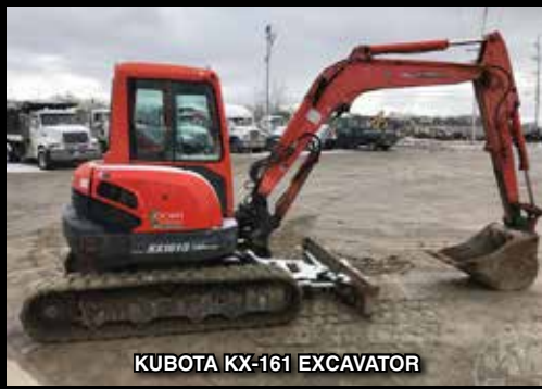
KUBOTA KX-161 EXCAVATOR