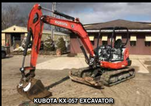
KUBOTA KX-057 EXCAVATOR