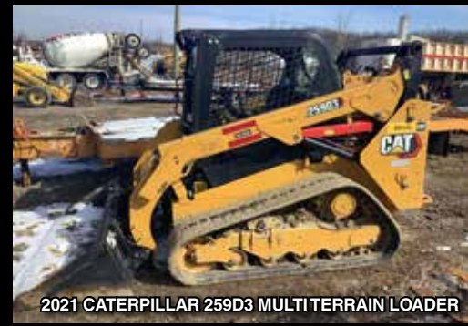
2021 CATERPILLAR 259D3 MULTI TERRAIN LOADER