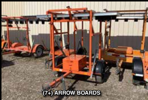
(7+) ARROW BOARDS