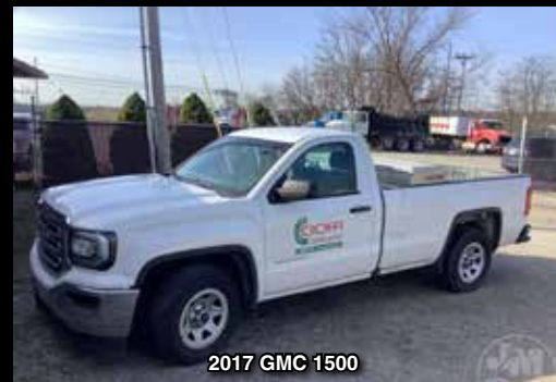
2017 GMC 1500