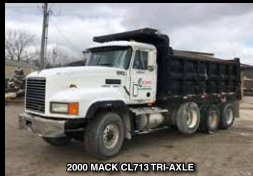
2000 MACK CL713 TRI-AXLE