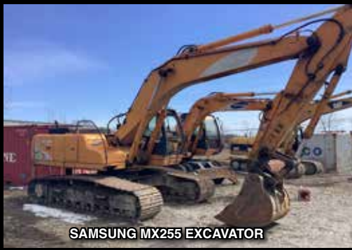
SAMSUNG MX255 EXCAVATOR