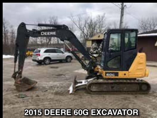
2015 DEERE 60G EXCAVATOR