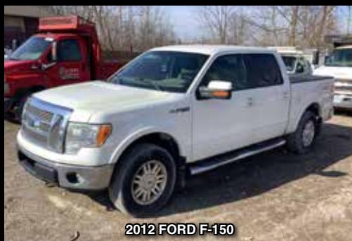
2012 FORD F-150