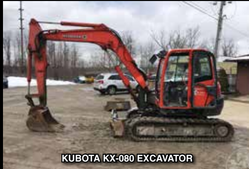
KUBOTA KX-080 EXCAVATOR