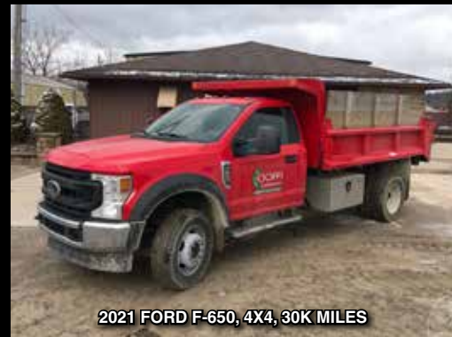
2021 FORD F-650, 4X4, 30K MILES