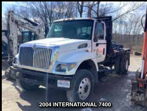
2004 INTERNATIONAL 7400