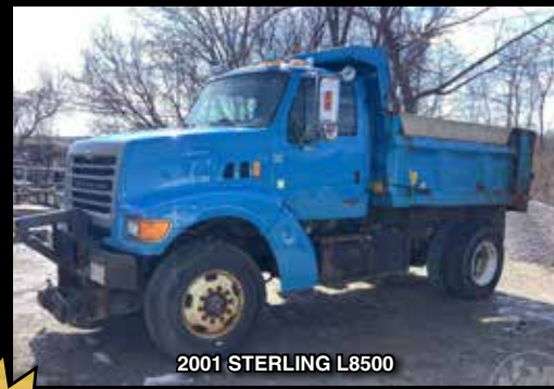
2001 STERLING L8500