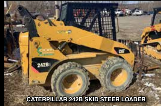
CATERPILLAR 242B SKID STEER LOADER