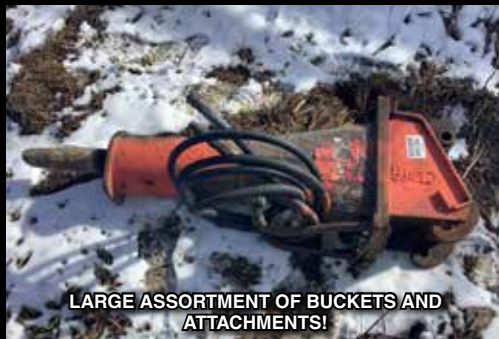
LARGE ASSORTMENT OF BUCKETS AND ATTACHMENTS!