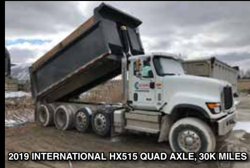
2019 INTERNATIONAL HX515 QUAD AXLE, 30K MILES