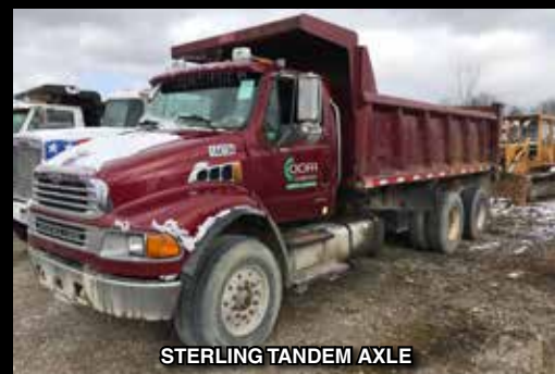
STERLING TANDEM AXLE