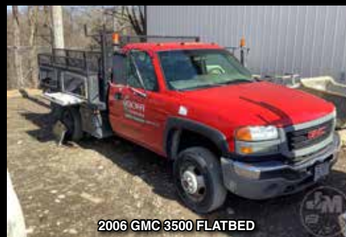
2006 GMC 3500 FLATBED