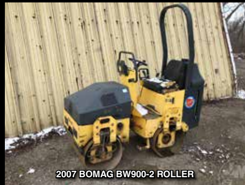
2007 BOMAG BW900-2 ROLLER