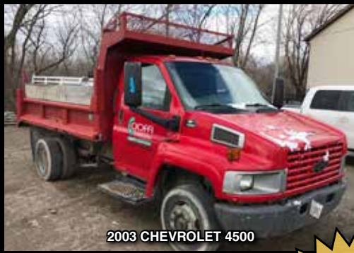
2003 CHEVROLET 4500