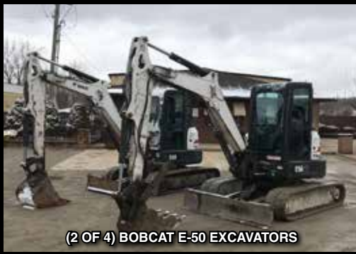
(2 OF 4) BOBCAT E-50 EXCAVATORS