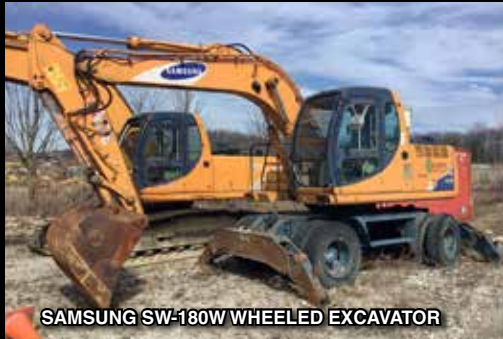
SAMSUNG SW-180W WHEELED EXCAVATOR