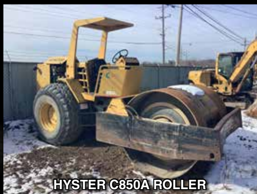
HYSTER C850A ROLLER

FEATURING: CONSTRUCTION EQUIPMENT, TRUCKS, TRAILERS AND RELATED ITEMS