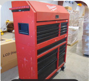
Milwaukee Combo Storage Cabinet-Chest

AUCTION LOCATION 3816 LEXINGTON PARK DR Elkhart, IN 46514