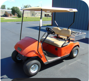
2009 Easy-Go golf cart