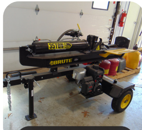
Brute log splitter, 35-ton, gas-powered