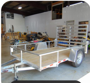
Aluminum trailer, 6' x 10'