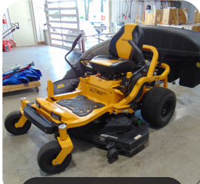
Cub Cadet Ultima ZT1 mower