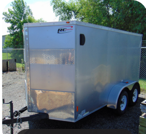
Cargo trailer, 6' x 12'