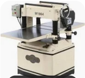
Shop Fox 20" (new) planer