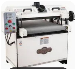
Shop Fox 26" (new) double drum sander