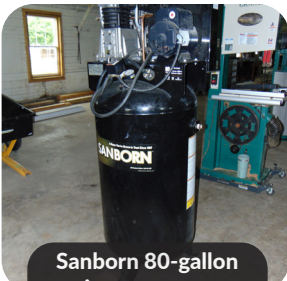
Sanborn 80-gallon air compressor