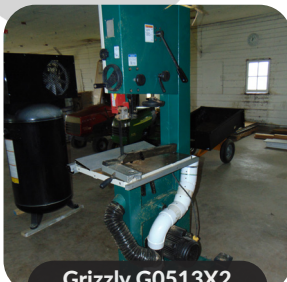
Grizzly G0513X2 Extr. Series band saw

AUCTION LOCATION 12142 COUNTY RD 24 Middlebury, IN 46540