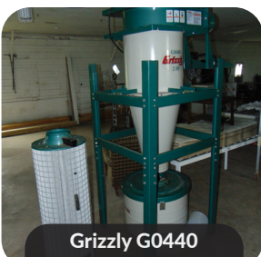
Grizzly G0440 Cyclone dust collector