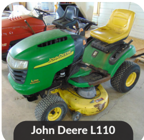
John Deere L110 lawn mower