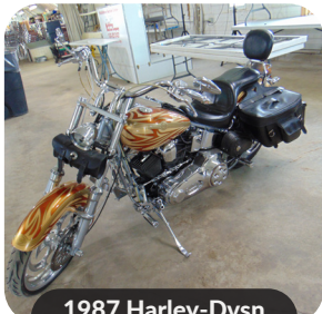
1987 Harley-Dvn FXSTC motorcycle