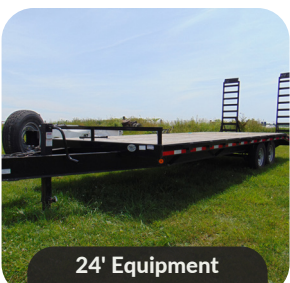
24' Equipment trailer