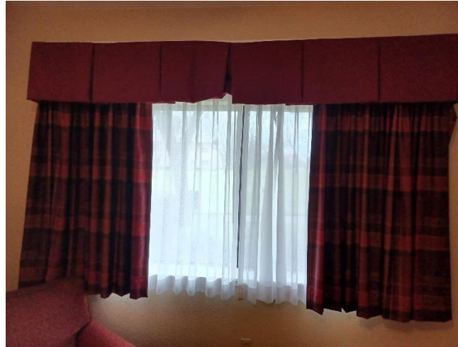
Valance: 100" w x 14.5" h x 10" d Quantity: 92