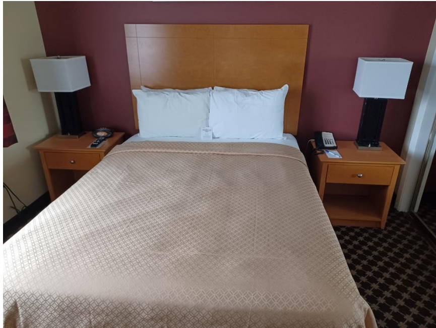
Headboard (Queen) 60" w x 36" h Quantity: 46