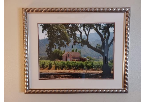
Artwork: 32.75" w x 26.75" h Quantity: 46