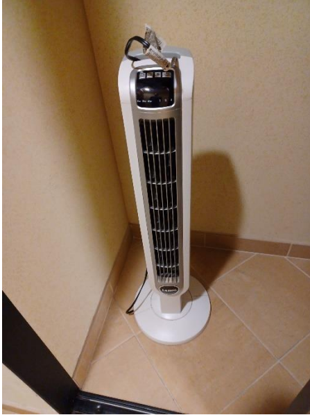
Lasko Tower Fan 36" h Quantity: 46