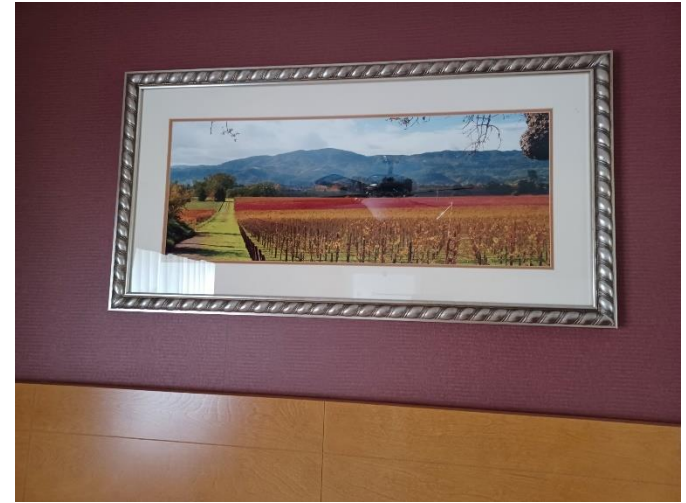
Artwork: 42" w x 21.75" h Quantity: 46