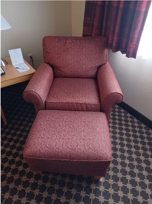
Lounge Chair: 38" w x 36" d Quantity: 46